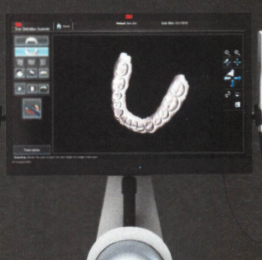
3M True Definition Scanner