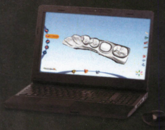
PLANMECA | PlanScan